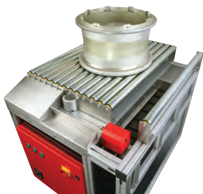
Veescan Model H ISO with wheel in place