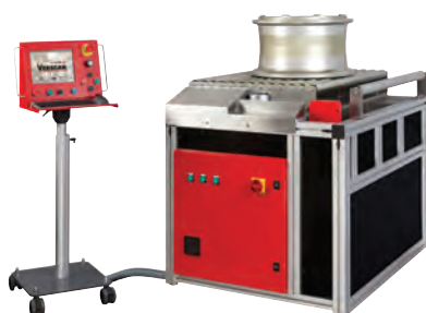
Veescan Model H with moveable control panel