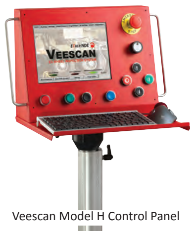
Veescan Model H Control Panel